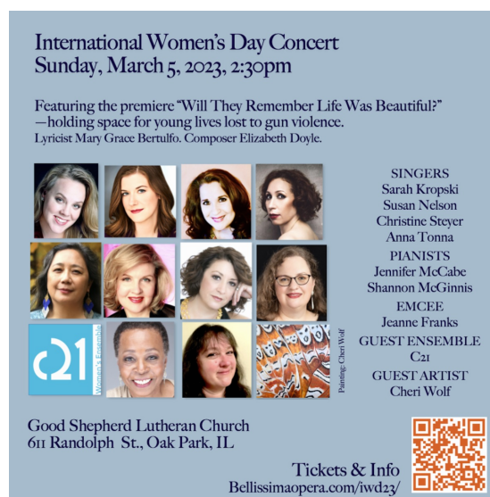
Place, date, ticket info and QR code.

Bellissima Opera is an initiative of Working in Concert, a not-for-profit performing arts alliance for cabaret, opera and classical vocal arts. Working In Concert educates, advocates for, and mobilizes a global network of singers who use the art of song to empower lives and build community. We strive to create space for and bring visibility to people and ideas that are all too often excluded by the mainstream.