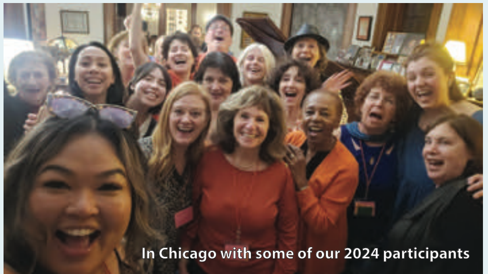
In Chicago with some of our 2024 participants

Advancing together the art of cabaret cabaretconnexion.org